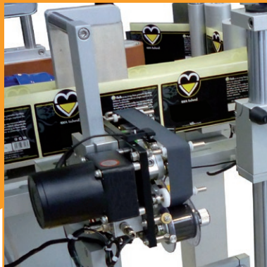
Hot foil coding unit

LABELX JR 140 EW Start photocell Conveying module with flat belt Wrap around device COMPACT main frame Horizontal and vertical microregulation unit